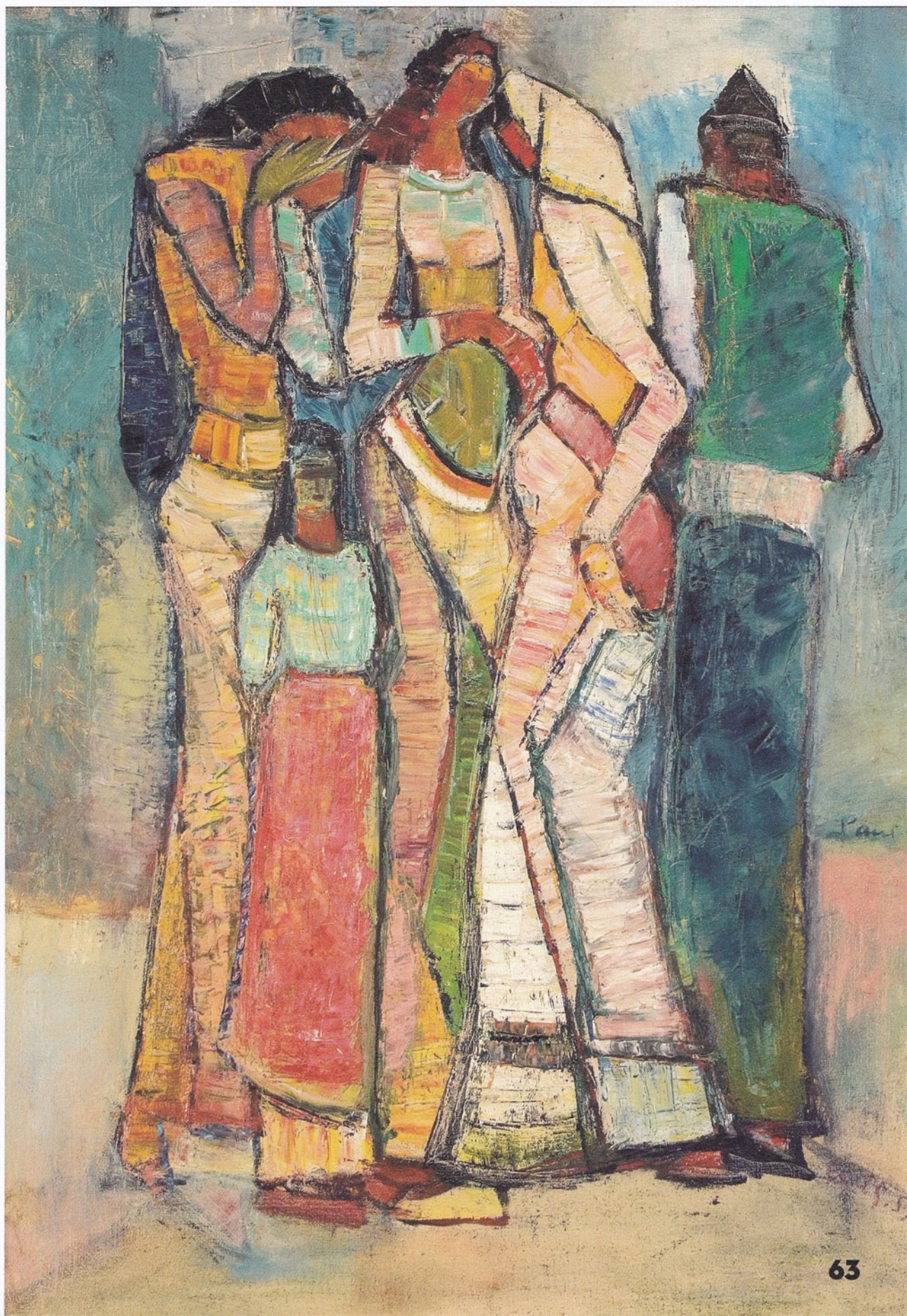
Paul Guiragossian, Le Depart (Melancholy) , oil on canvas, 100 x 70 cm