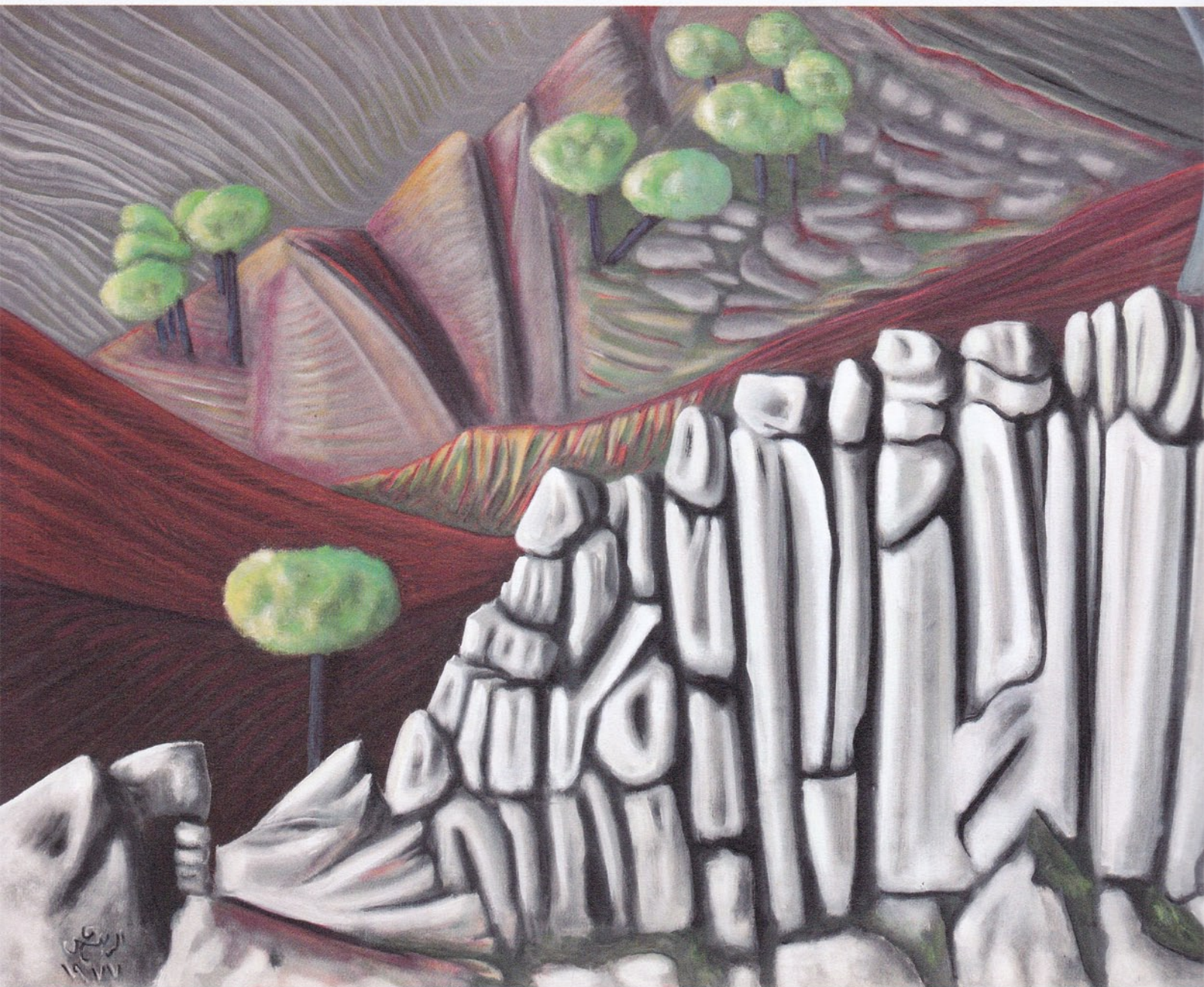
above: Aref Rayess, Soukhour Meyrouba , oil on canvas, 80 × 110 cm