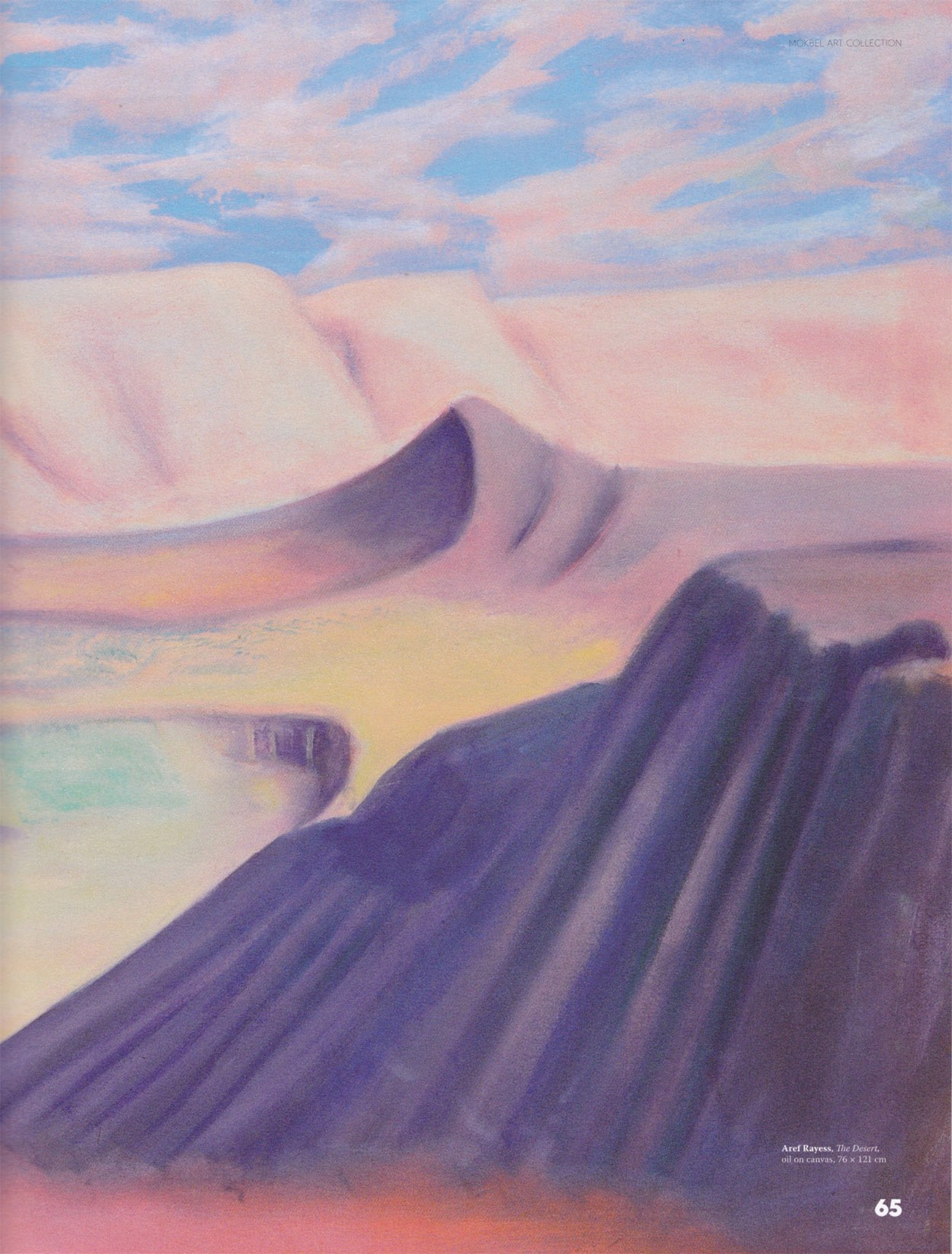
Aref Rayess, The Desert , oil on canvas, 76 x 121 cm