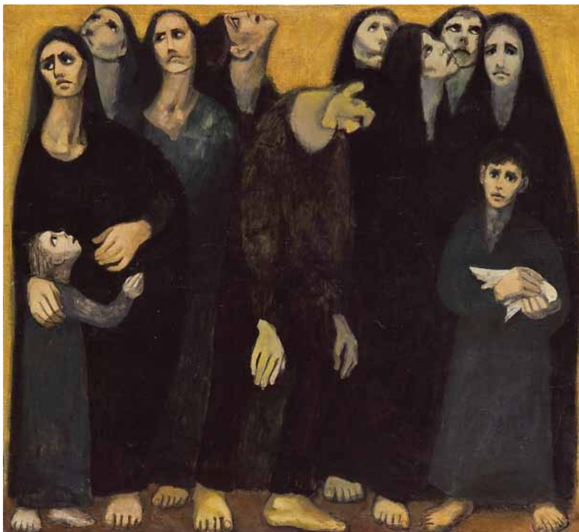
Luay Kayyali, Untitled, Oil on Canvas, 172x190cm - Courtesy of Khaled Samawi Collection.

CP: Last year you had a very successful exhibition in Dubai featuring works from the collection, could you speak about your next public exhibition?