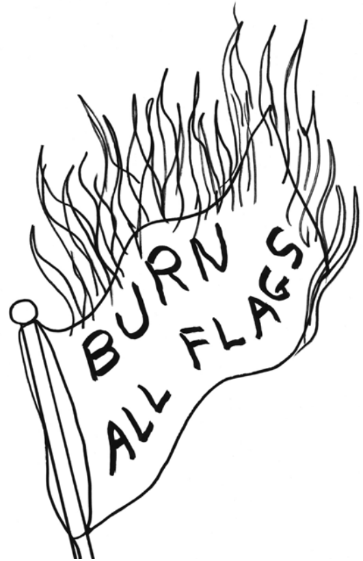
DAVID SHRIGLEY , Untitled (Burn all flags), 2011, Drawing, Ink on paper, 29.7x21cm (11.69 x 8.27 in), Unique work.