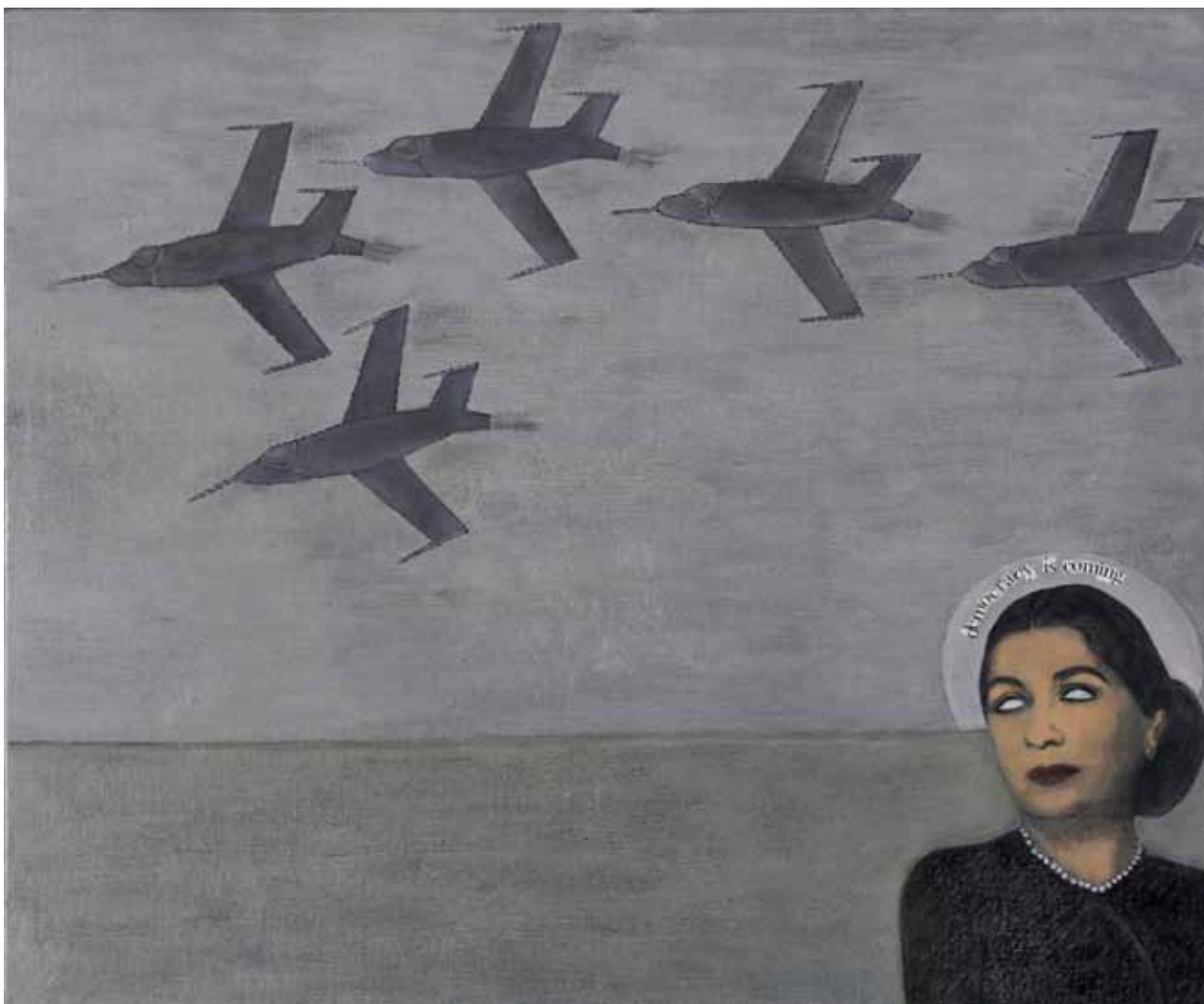
Huda Lutfi, Democracy is coming, 2008, Mixed Media on Canvas, 35x45cm

CP: Where do you see the Mokbel Collection in 10 years from now?