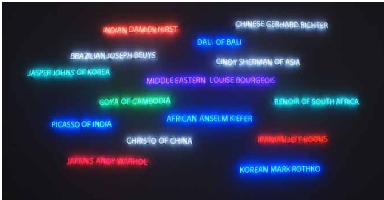
Leila Pazooki, Moments of Glory, 2010, neon light tubes, transformer, variable dimensions, - Courtesy of Nadour Collection