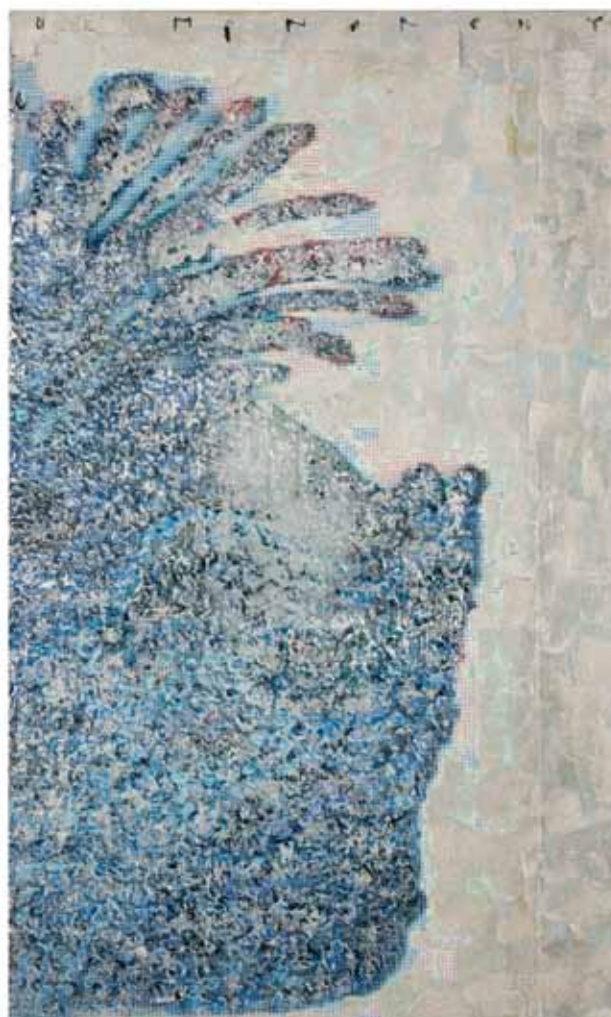
Reza Derakhshani , Divided Landscape of a blue Monarchy , 2011, Mixed Media on Canvas, Dyptech each 140X85cm

environment; we have 142 nationalities and 43 religions in Dubai. It really is a role model for the entire Middle East, so why not extend this idea of being a role model to the arts by opening a museum? I am very proud that they [Dubai] have recognized my support for the arts, but I see a need missing, the need for more education and, especially in Dubai, for a museum.