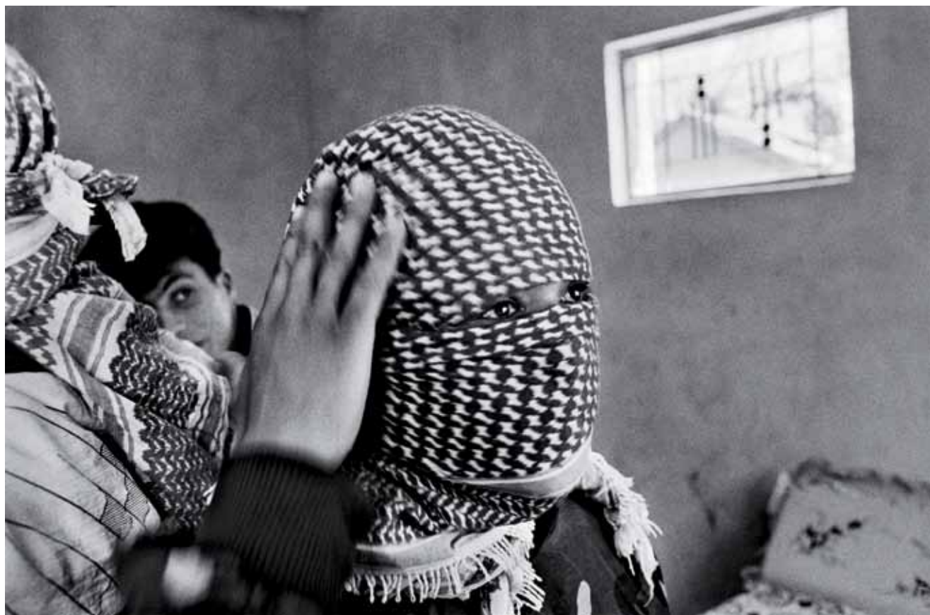
Fouad Elkoury, Born Loser (Diptych) , 2009, Ink jet print mounted - Courtesy of Barajeel Foundation.

CP: What was the first piece you purchased?