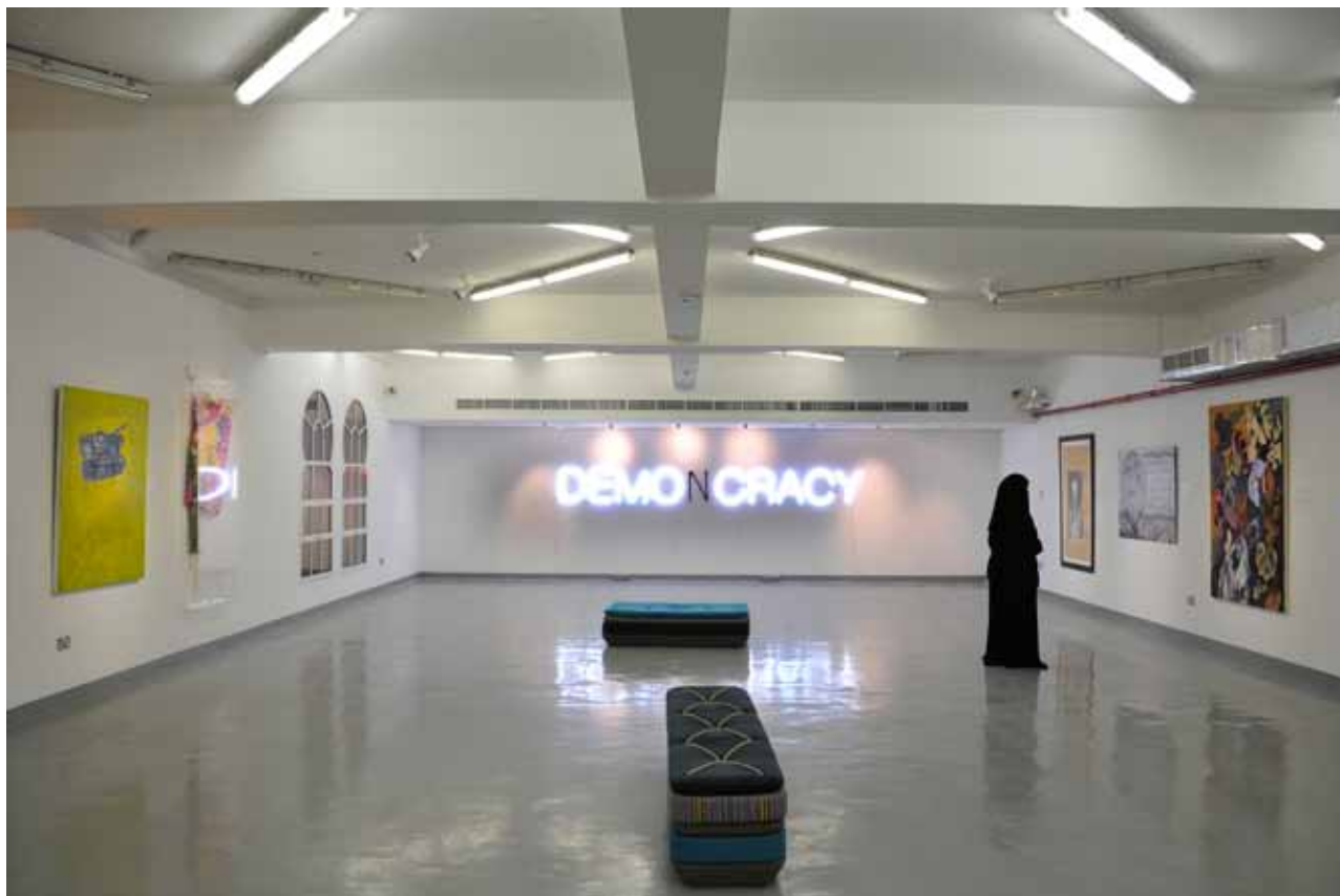
Barajeel - Strike Oppose Installation view - Courtesy of Barajeel Foundation

Art collecting and subsequently collectors are often removed from the public view. Although collectors are some of the biggest patrons of the arts and all the institutions and infrastructures that make up the art world—both in the commercial and non-profit sector, somehow collectors, perhaps with the exception of a few larger-than-life characters in the international art world, are often cloaked in mystique. In the past decade, the Middle East, a historic cultural center, has risen swiftly to become a major player in the international art scene,