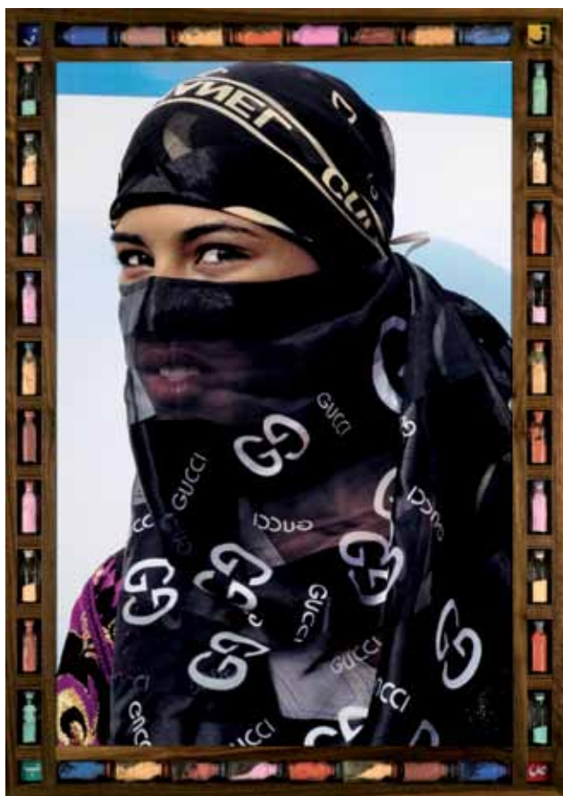
Hassan Hajjaj, MaliciousLook, 2000, Edition of 10, Lumbda Print and mixed Media, 84x59.5cm