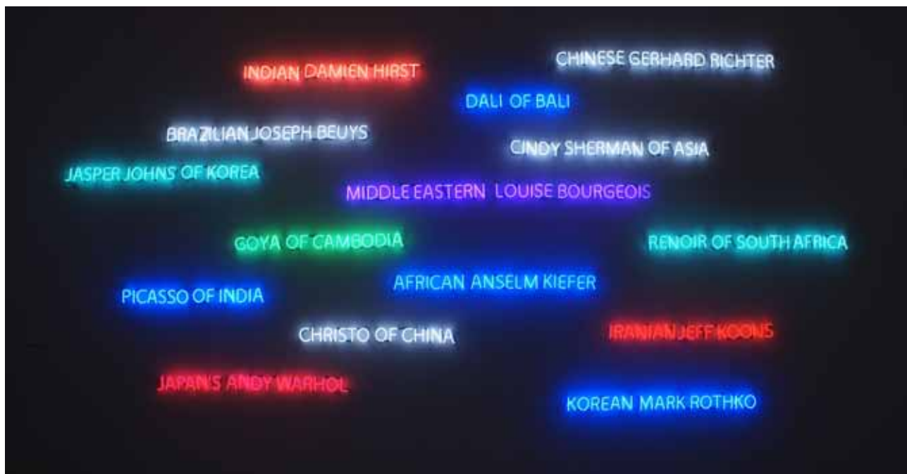
Leila Pazooki, Moments of Glory, 2010, neon light tubes, transformer, variable dimensions, - Courtesy of Nadour Collection