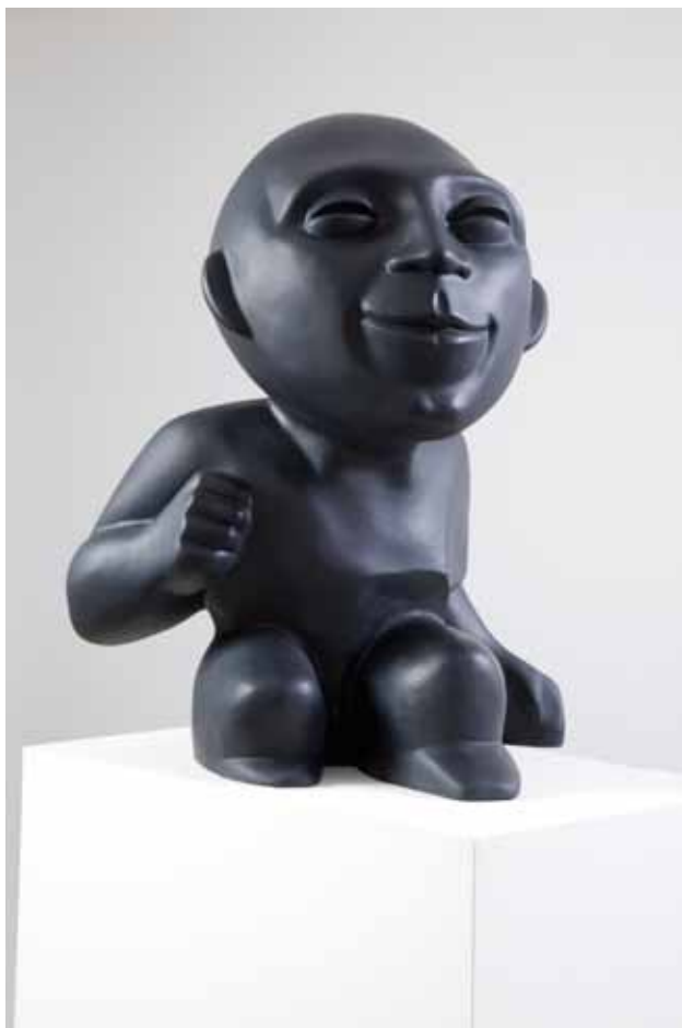
Fadi Yazigi, King Che, 2008, bronze, edition 7/8, 90cm - courtesy of CAP Kuwaiti artists.

CP: How does CAP operate structurally? Is there a museum structure with curatorial and educational departments?