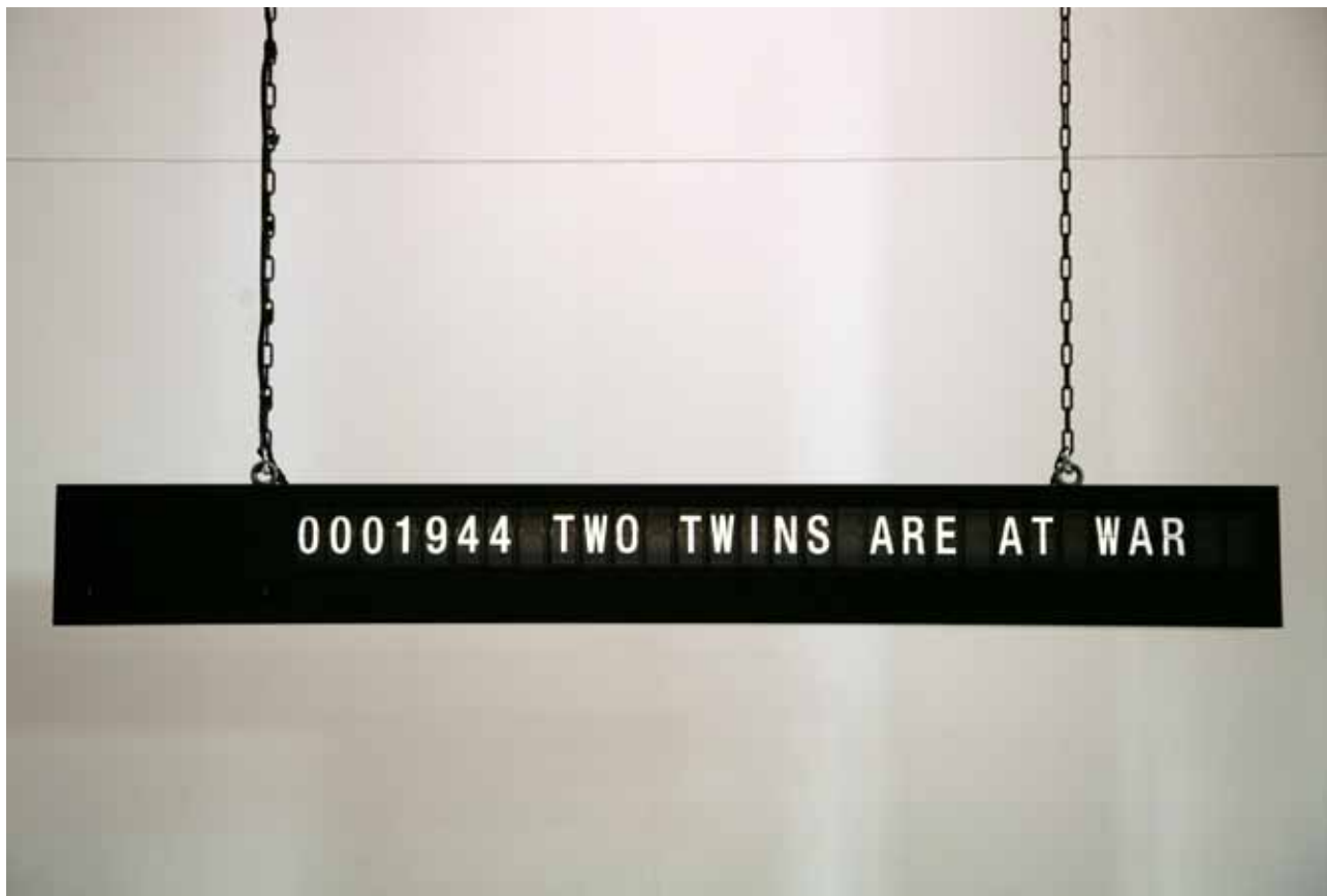
Shilpa Gupta , Untitled, 2009, flapboard, Duration ca. 20 min, 70.87 x 8.58 x 9.84 in (180 x 21.8 x 25 cm), 45 kg, Edition 3/3(Inv# SHGU-0036.3).

CP: What are your thoughts on the Dubai art scene's impressive growth spurt?