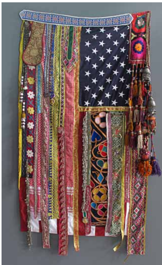
Sara Rahbar, Flag #16 - Use this distance to forget who i am, 2008, textiles & mixed media, 170x91.5cm - Courtesy of SPM.

second thought in Dubai. Instead of another handbag or car, buy art!