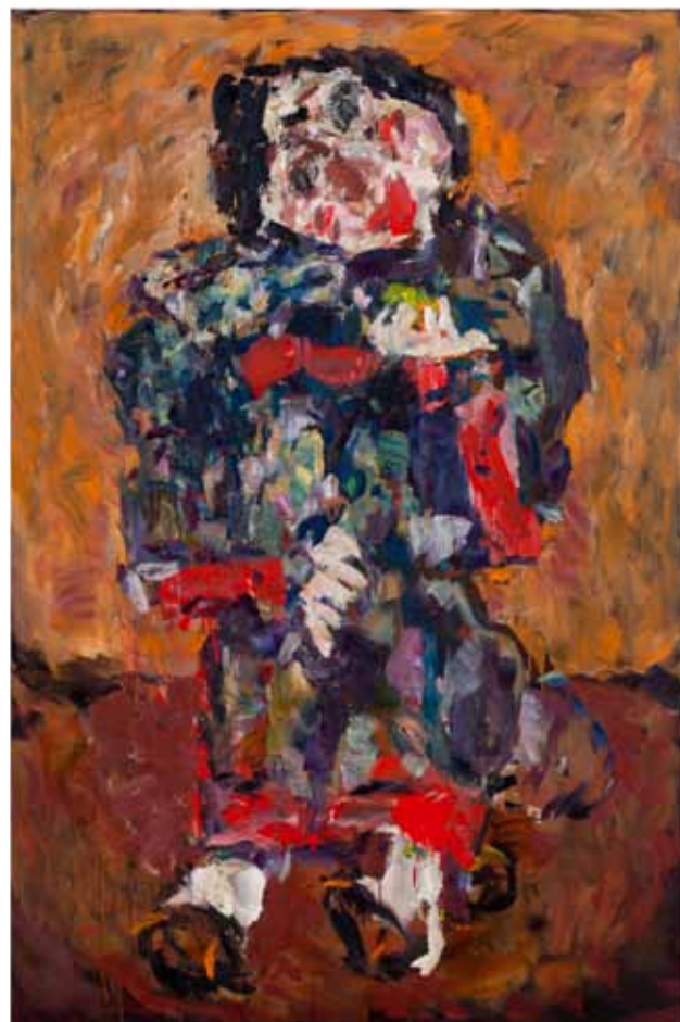
Marwan Kassab Baachi, Marionette, 2010, oil on canvas, 130x194cm

LAG: There will be those departments once we gain steam, yes. For now, we are letting guest curators come in while we at CAP focus on developing the education portion. We are opening studio hours for artists, bringing in speakers for panels about things like the Middle Eastern art market and collecting art as an investment. We're offering painting and calligraphy classes to coincide with an exhibit on modern Arab abstract painters and one on Arab and Iranian graphic arts, respectively. We will expand into performing arts eventually and also set up a retail corner for the