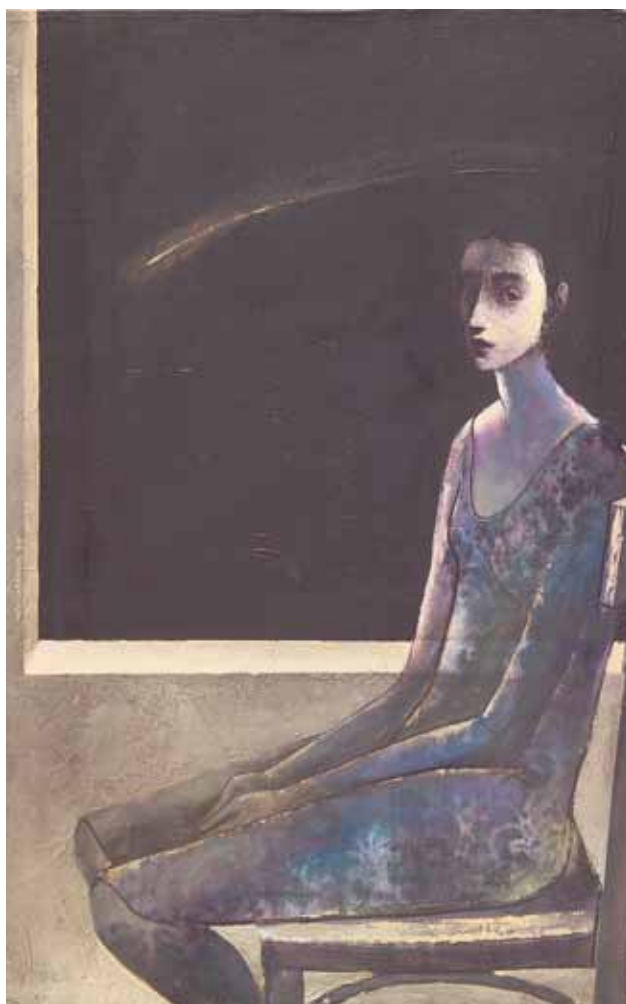
Safwan Dahoul , Untitled , 1997, Acrylic on Canvas, 80x60cm

Middle Eastern art scene, specially sponsoring and collecting younger artists. They are all partners with us.