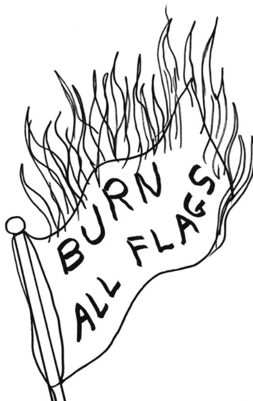
DAVID SHRIGLEY , Untitled (Burn all flags), 2011, Drawing, Ink on paper, 29.7x21cm (11.69 x 8.27 in), Unique work.