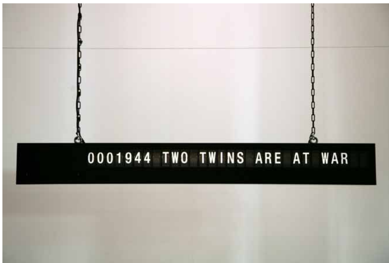
Shilpa Gupta , Untitled, 2009, flapboard, Duration ca. 20 min, 70.87 x 8.58 x 9.84 in (180 x 21.8 x 25 cm), 45 kg, Edition 3/3(Inv# SHGU-0036.3).

CP: What are your thoughts on the Dubai art scene's impressive growth spurt?